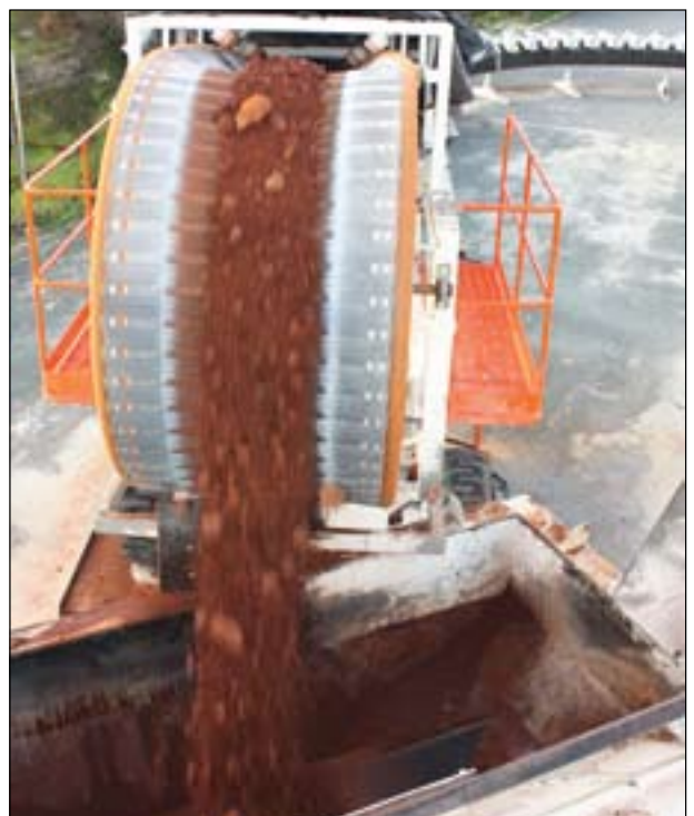
ICS conveying iron ore.