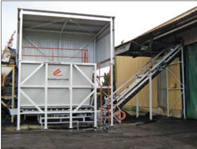
Second ICS at Baileys Fertilisers with hopper.

Innovative Conveying Systems International (ICSI), which has developed a patented enclosed belt conveying system, has signed a partnering agreement with engineering giant Bilfinger Berger Services (Australia).