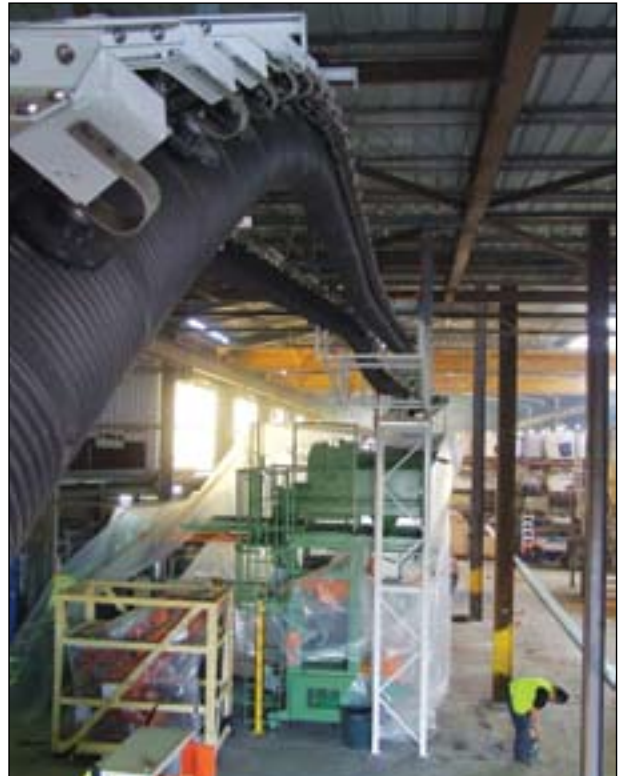
Second ICS installation at Baileys Fertilisers shows ICS suspended from the factory roof conveying fertiliser to the bagging machine.

The ICS conveys a wide range of materials around tight curves, up steep inclines (up to 80 degrees) and over long distances. Thus,