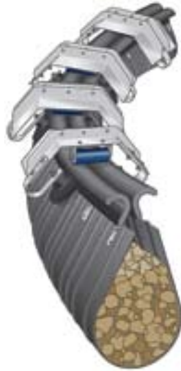
Illustration of ICS curved belt cross-section.

The second ICS conveys mulch, potting mix and soil conditioner at a rate of 10tph from a feeder located outside the